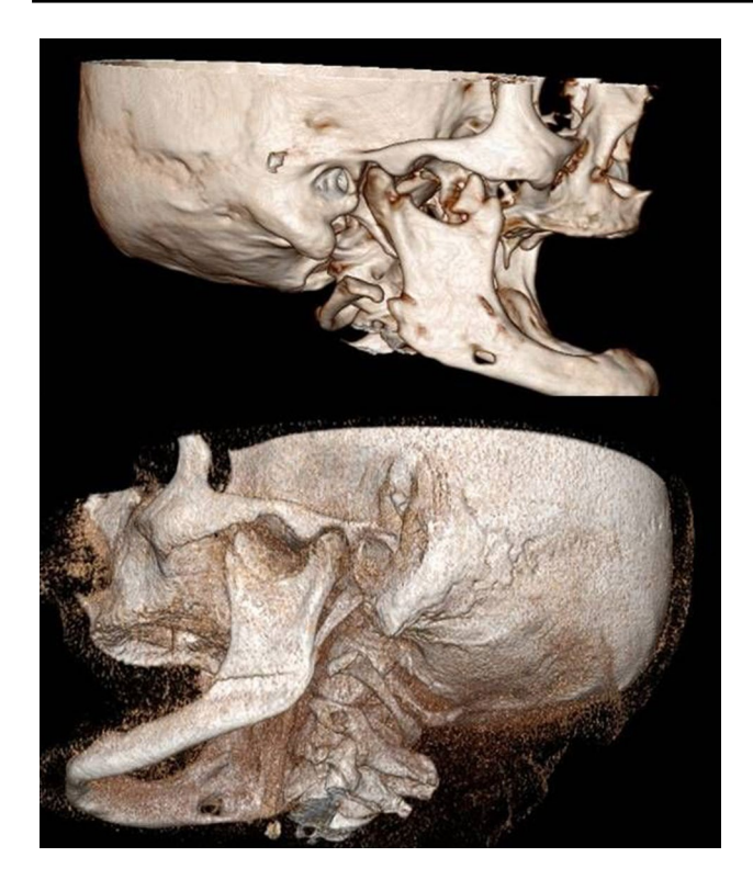
Fig. 3 The 3-D reconstruction showing the buccal cortical perforation without expansion and a greater area of bone defect on the lingual cortex