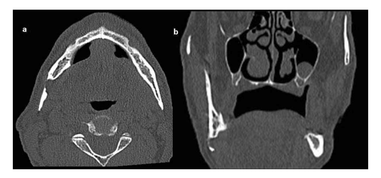
Fig. 1 The axial (a) and coronal (b) showing the posterior lingual variant of Stafne's bone defect with significant erosion of buccal cortex leading to perforation but without any evidence of expansion

The asymptomatic clinical picture and typical location of the lesion below the inferior alveolar canal along with its density consistent with the salivary gland tissue and adipose tissue (- 30 to 60 HU) favored the diagnosis of SBD with bicortical involvement. Since the patient was asymptomatic, no active treatment was given for SBD. However, implant-supported prosthetic rehabilitation for the patient was continued and the patient was kept on regular follow-up.