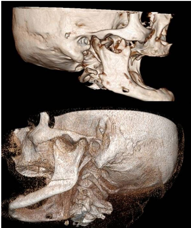
Fig. 3 The 3-D reconstruction showing the buccal cortical perforation without expansion and a greater area of bone defect on the lingual cortex