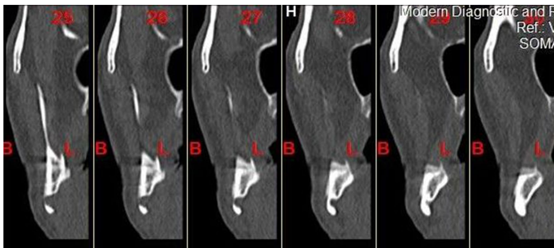
Fig. 2 The cross-sectional images showing the location of the defect below the mandibular canal and leading to buccal cortical perforation