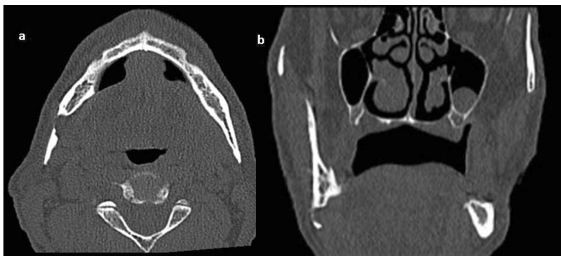
Fig. 1 The axial (a) and coronal (b) showing the posterior lingual variant of Stafne's bone defect with significant erosion of buccal cortex leading to perforation but without any evidence of expansion

The asymptomatic clinical picture and typical location of the lesion below the inferior alveolar canal along with its density consistent with the salivary gland tissue and adipose tissue (– 30 to 60 HU) favored the diagnosis of SBD with bicortical involvement. Since the patient was asymptomatic, no active treatment was given for SBD. However, implant-supported prosthetic rehabilitation for the patient was continued and the patient was kept on regular follow-up.