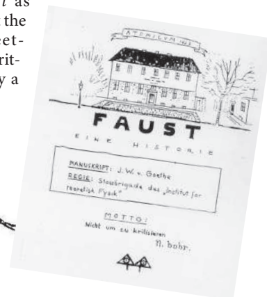
Wolfgang Pauli as the Devil in a parody of Faust , performed by physicists at a meeting in 1932.