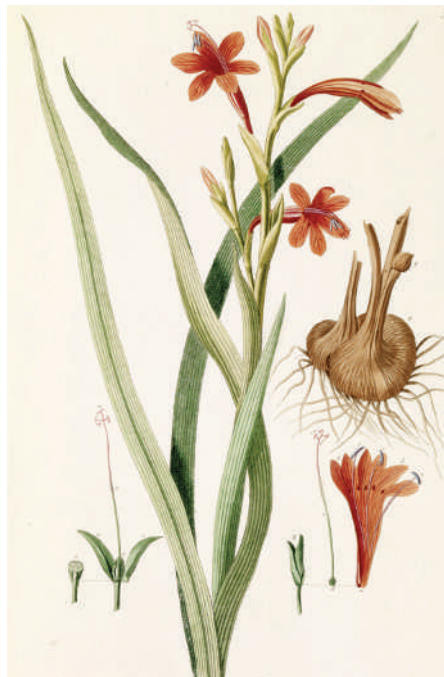
One of many plant species named by Linnaeus.