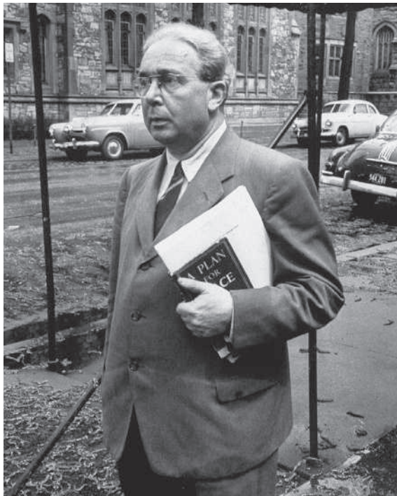
Leo Szilard was among the first to conceive of a nuclear weapon.

In the end, the cobalt bomb was never very