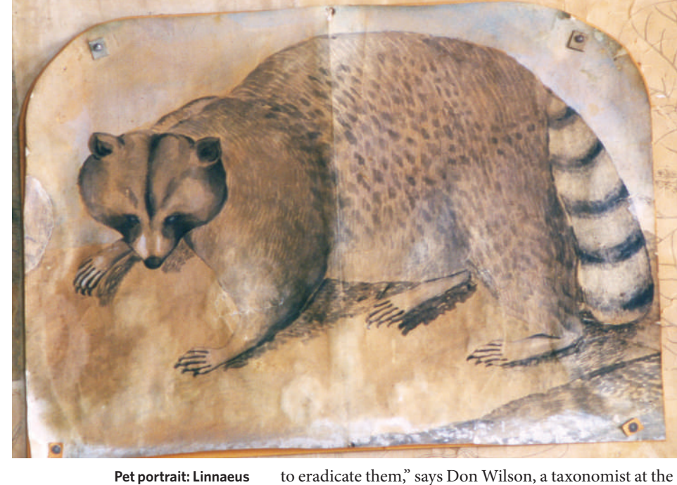
Pet portrait: Linnaeus hung this watercolour of Sjupp the raccoon at his summerhouse.

"In the Bahamas, they were delighted. They instantly changed the raccoon's status from endangered to invasive spe-