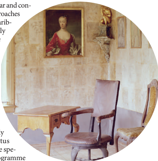
Linnaeus’s study at Hammarby, Uppsala, Sweden.