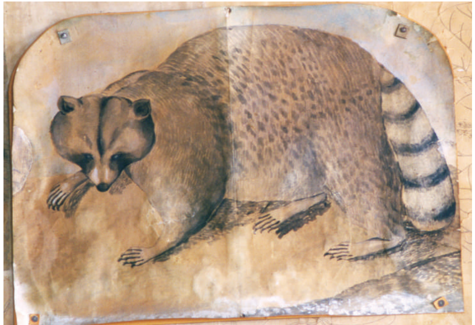
Pet portrait: Linnaeus hung this watercolour of Sjupp the raccoon at his summerhouse.

“In the Bahamas, they were delighted. They instantly changed the raccoon’s status from endangered to invasive spe- cies and set up a control programme