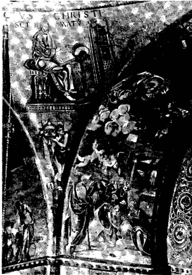
FIGURE 1. One of the four spandrels of St Mark's; seated evangelist above, personification of river below.

The design is so elaborate, harmonious and purposeful that we are tempted to view it as the starting point of any analysis, as the cause in some sense of the surrounding architecture. But this would invert the proper path of analysis. The