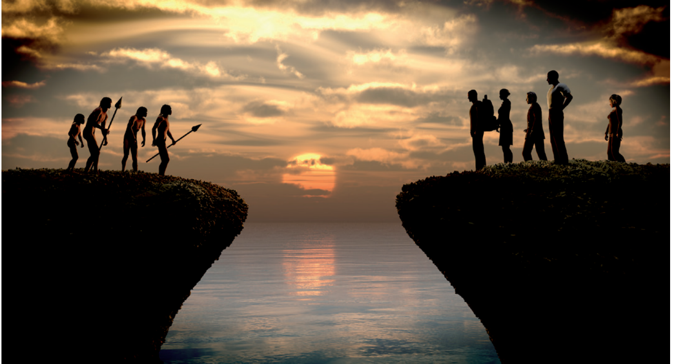
ILLUSTRATION BY CHRISTIAN DARKIN

EMPLOYMENT The skills gained in PhD training make it worth the money p.41